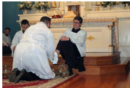
Easter lasts 50 days! Alleluia! See more photos on our website: www.ccjc3.org