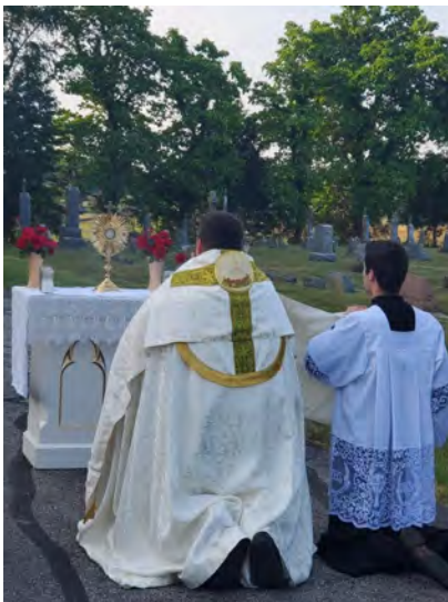
OUR CORPUS CHRISTI CELEBRATIONS at St. Joseph's & St. Mary's. See more photos on our website!