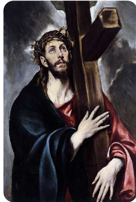
The famous painting of Christ Carrying His Cross by El Greco -1580

Who are You inviting me to love or help this Lent? // How are you being called to love and serve this year?//What good deeds can I perform for my community, or my family out of charity?// Can I pray for the sick of my parish more each day, the dying, or even the Poor Souls in Purgatory with short prayers?