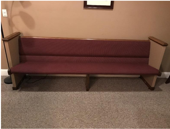
PEWS FOR SALE

Anyone interested in purchasing one of the pews taken out of St. Mary's balcony last year for $100 each can do so by contacting the Parish Office at 812-346-3604. Actual pews can be seen in the Adoration Chapel. Let the office know by December 28 th if you are interested in buying one