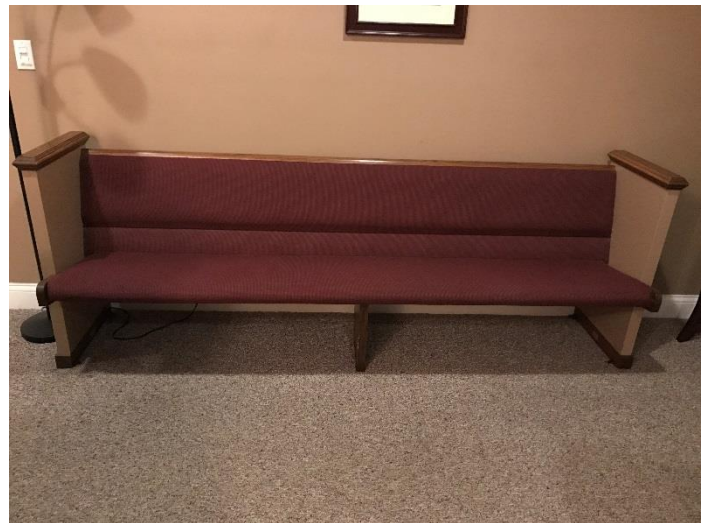
PEWS FOR SALE

Anyone interested in purchasing one of the pews taken out of St. Mary's balcony last year for $100 each can do so by contacting the Parish Office at 812-346-3604. Actual pews can be seen in the Adoration Chapel.